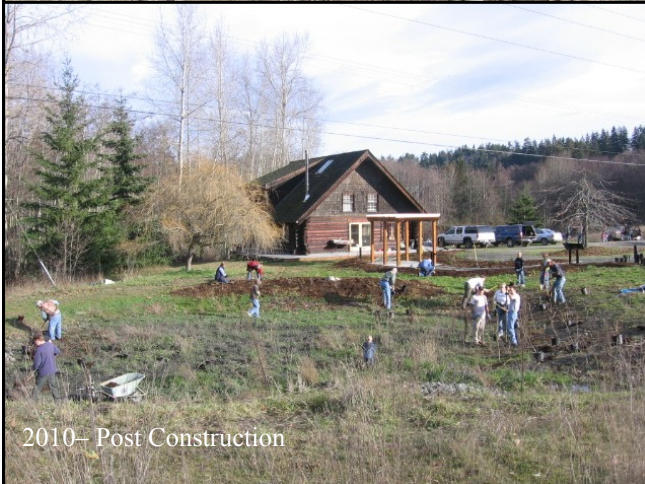
2010- Post Construction