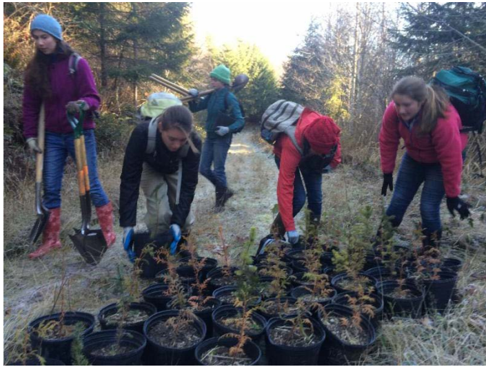
Chimacum HS students prepare to plant cedars and spruce along the West Fork of Chimacum Creek