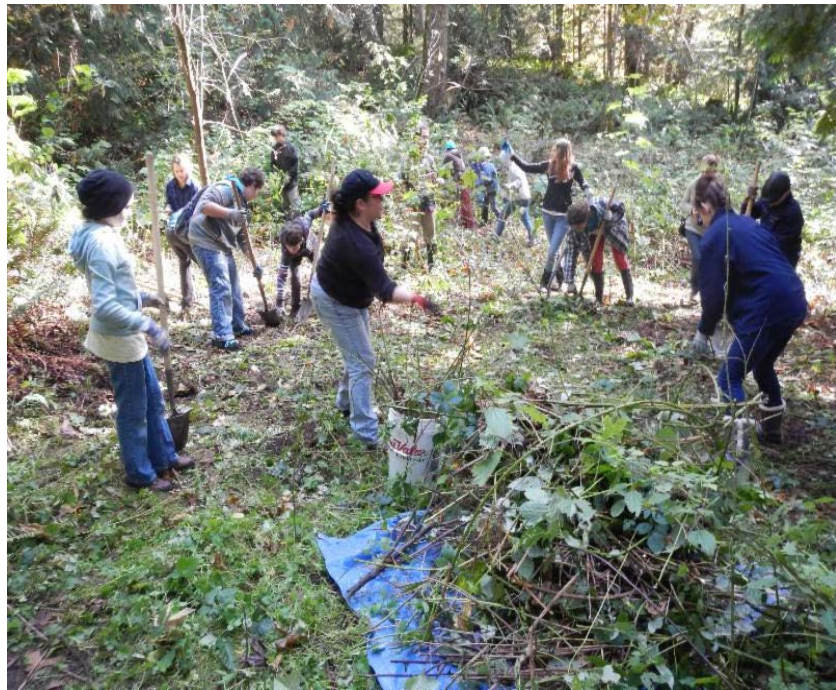
Chimacum Schools Pi Service Day at S-Curve Preserve in Irondale