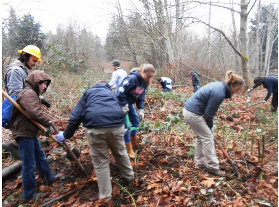
Removing Blackberry at Irondale Beach Park, January 2013

October 26, from 10am to 2pm. Lunch is provided. Bring your gloves! RSVP to Jazz: (360) 437-1199 or weller@isp.com