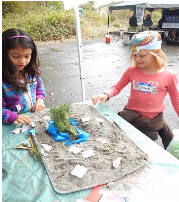
Students create model watersheds at the Dungeness River Festival