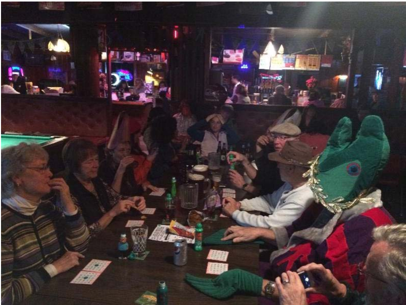
Salmon Claus unwinds with some friends at Bingo Night after a busy Fish'mas