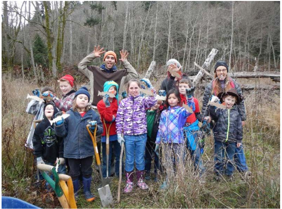
Volunteers, Franklin Elementary students take a break from planting trees at Morse Creek to show off their new "Salmon grow on Trees" ornaments

You can listen to Nature Now every week on KPTZ 91.9 FM