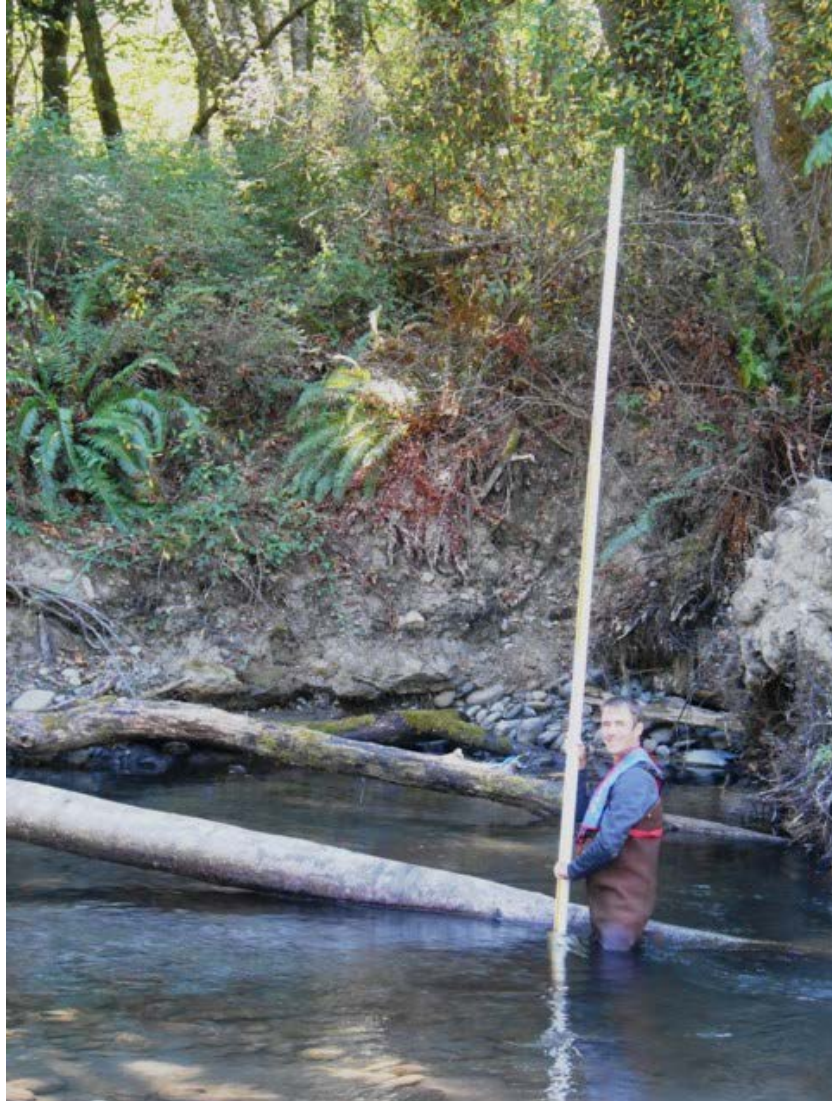
A volunteer measuring the depth of Morse Creek

When: Weds-Fri the whole month of Sept, and August 29th and 30th 9am-12:30pm and/or 1pm-4pm