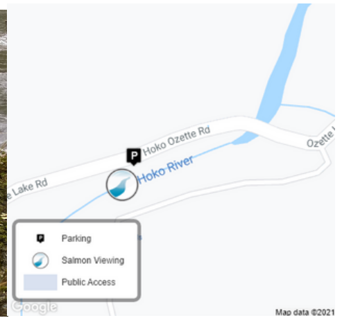
Map data ©2021